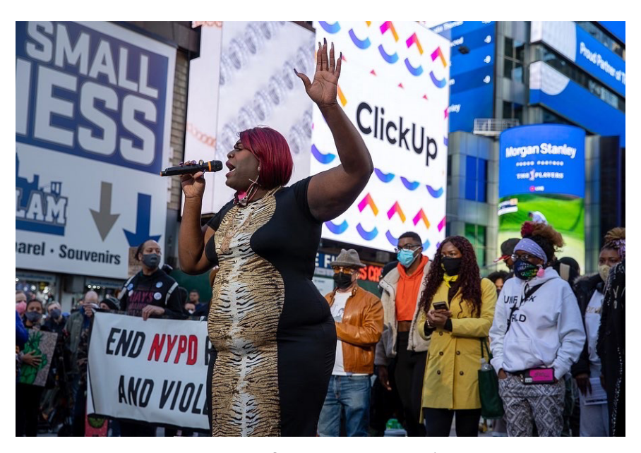
Times Square. Justice for Breonna Taylor protest. 3/16/21.