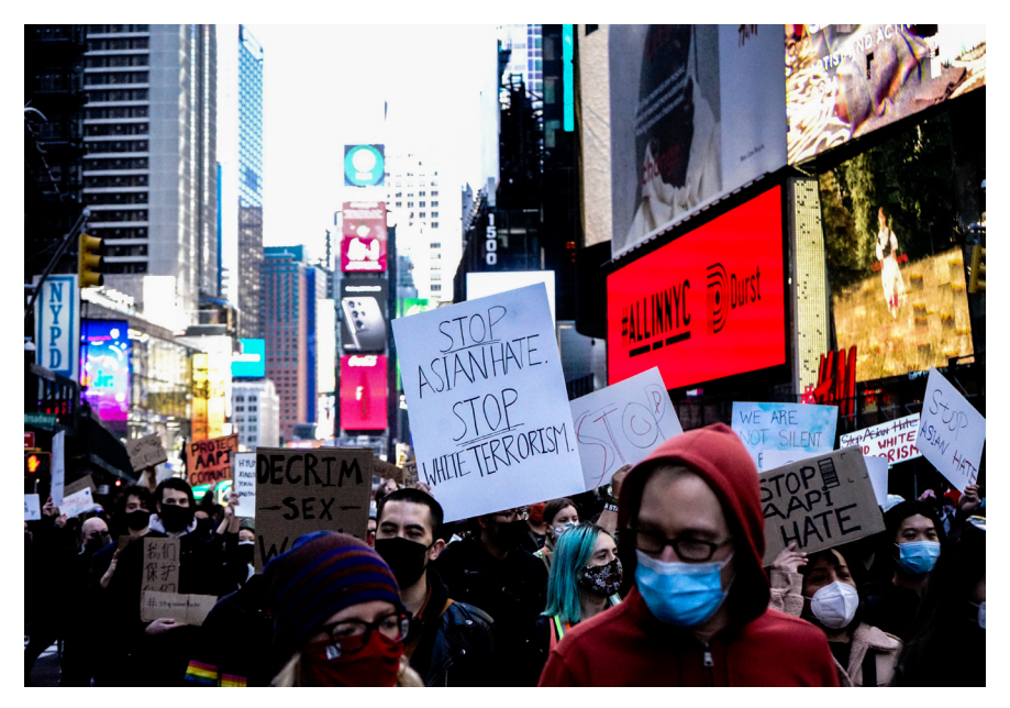
Times Square. End anti-Asian violence protest. 3/20/21.

What does your photography of protest mean to you?