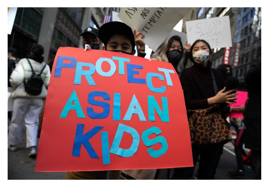
Washington Square Park. Stop Asian hate protest. 3/21/21.