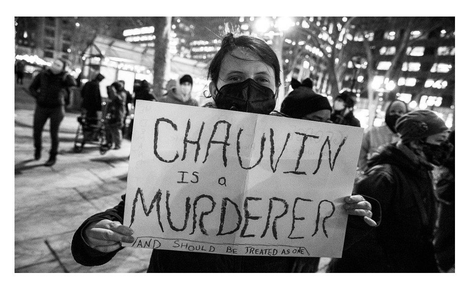
Bryant Park. Justice for Floyd march on first day of Chauvin trial. 3/8/21.