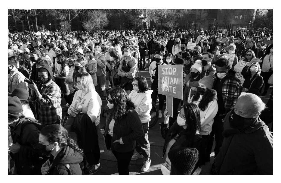
Stop Asian hate protest. 3/21/21.