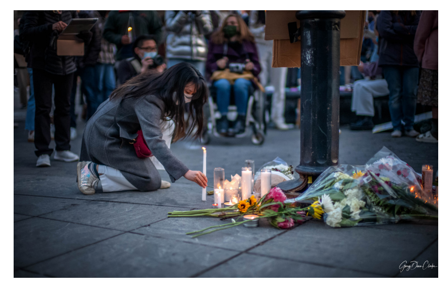
Washington Square Park. Vigil for lost Asian lives. 3/20/21.