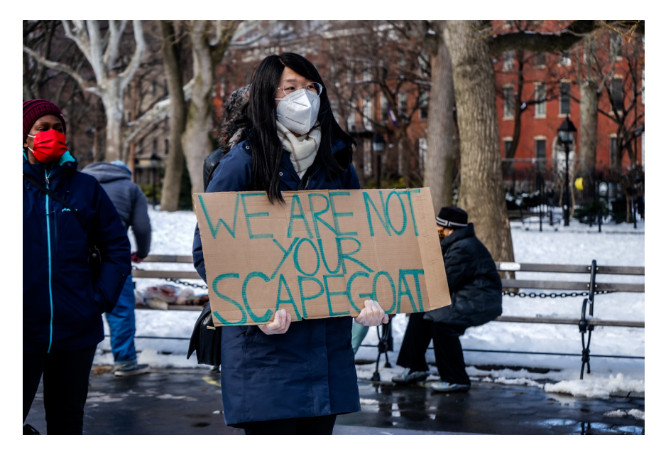
Washington Square Park. End anti-Asian violence protest. 2/20/21.