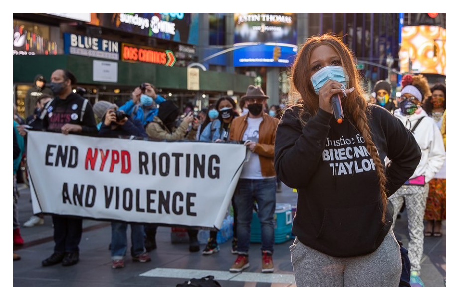
Times Square. Justice for Breonna Taylor protest. 3/16/21.