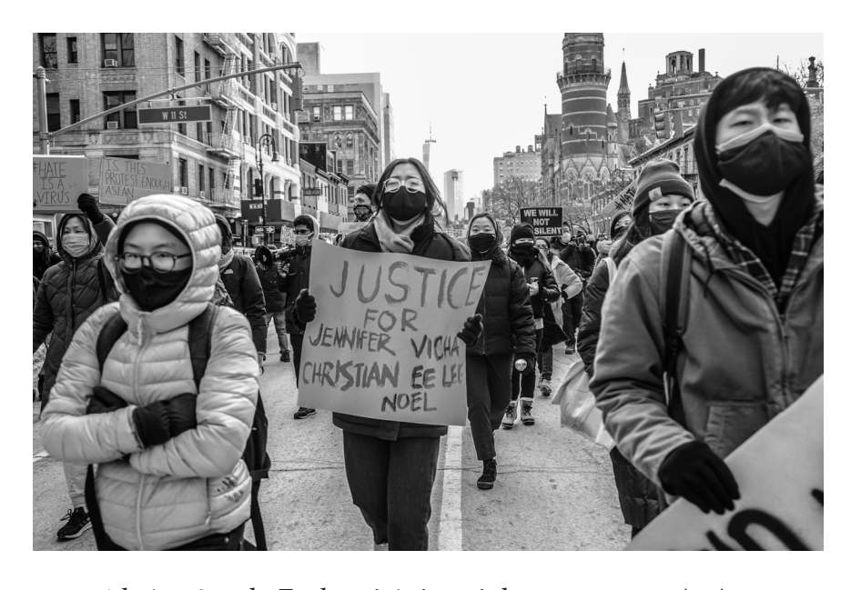
6th Ave & 11th. End anti-Asian violence protest. 2/20/21.