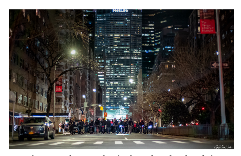
Park Ave & 38th. Justice for Floyd march on first day of Chauvin trial. 3/8/2I.