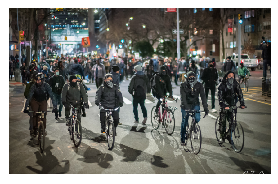
Park Ave & 38th. Justice for Floyd march on first day of Chauvin trial. 3/8/21.