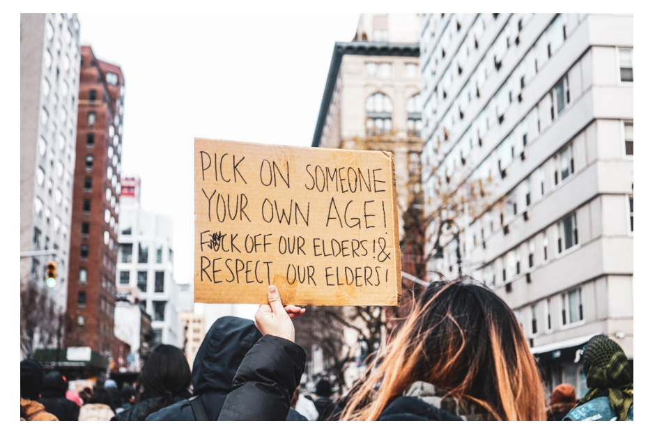
6th Ave & 12th. End anti-Asian violence protest. 2/20/21.