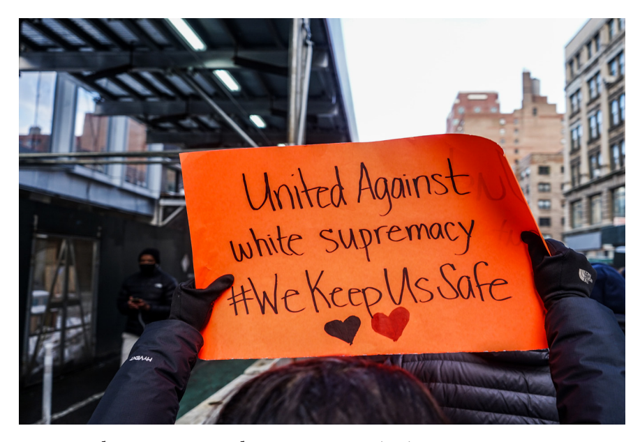
End anti-Asian violence protest. 2/20/21.