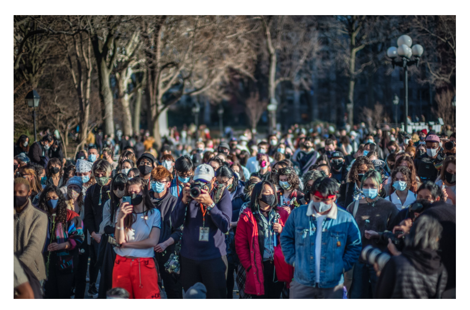
Washington Square Park. Vigil for lost Asian lives. 3/20/21.