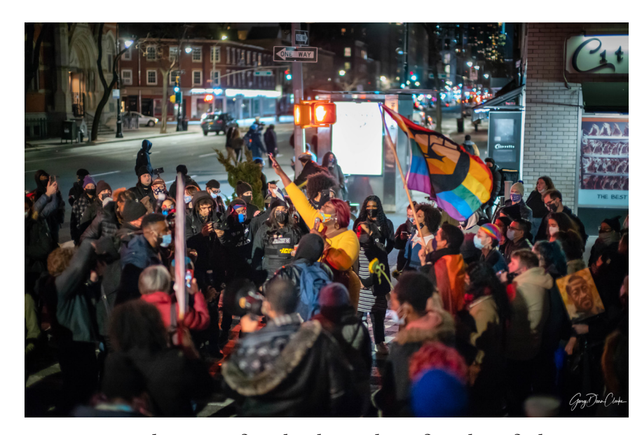
Bryant Park. Justice for Floyd march on first day of Chauvin trial. 3/8/21