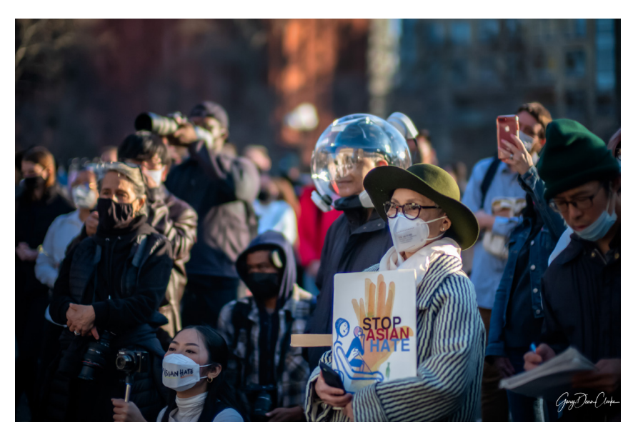
Washington Square Park. Vigil for lost Asian lives. 3/20/21.